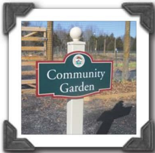
Pleasant Grove Park